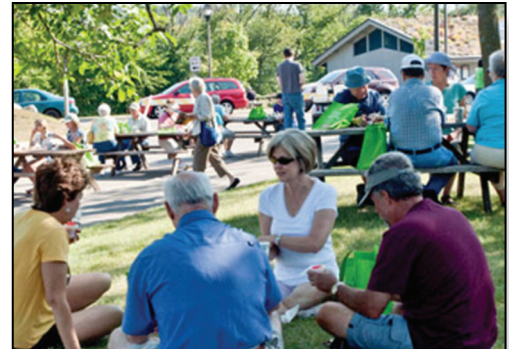
Meet at the Margot Picnic Shelter A

Margo Picnic Shelter A has been rented for our afternoon picnic. The grounds are open for exploration from 8 a.m. to 8 p.m. For informaton about what to do at the Arb' and how to get there, go to the website or see the activity list on the next page.